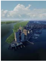
As seen in the NY Times book review