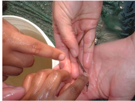
Children touch a Northern Pipefish—a Hudson River relative of the seahorse.

Spaces still available—sign up now! BECZAK'S SUMMER CAMP RIVER EXPLORERS